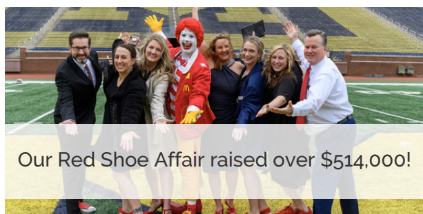
Our Red Shoe Affair raised over $514,000!