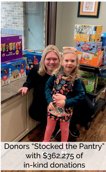
Donors "Stocked the Pantry" with $362,275 of in-kind donations