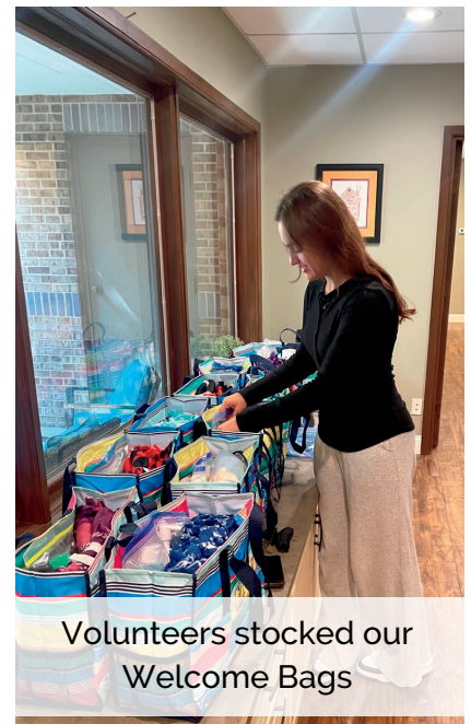
Volunteers stocked our Welcome Bags