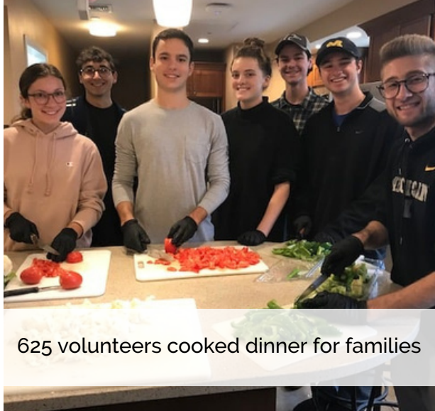
625 volunteers cooked dinner for families