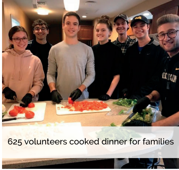
625 volunteers cooked dinner for families