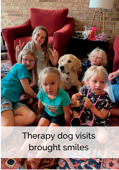
Therapy dog visits brought smiles