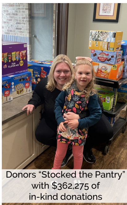
Donors "Stocked the Pantry" with $362,275 of in-kind donations