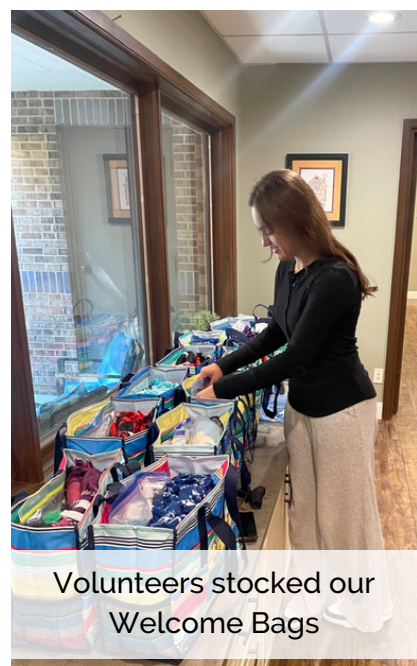
Volunteers stocked our Welcome Bags