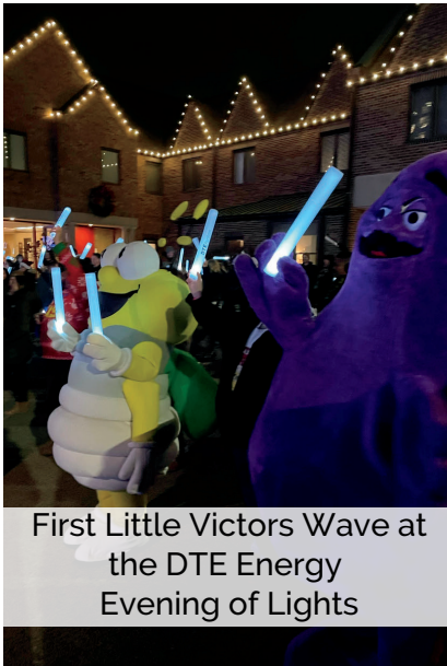
First Little Victors Wave at the DTE Energy Evening of Lights