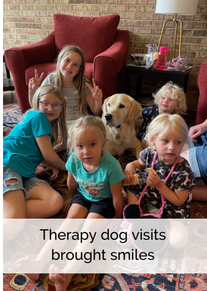
Therapy dog visits brought smiles