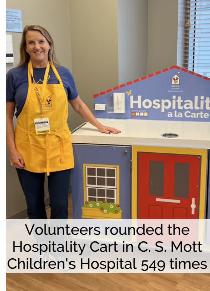
Volunteers rounded the Hospitality Cart in C. S. Mott Children's Hospital 549 times