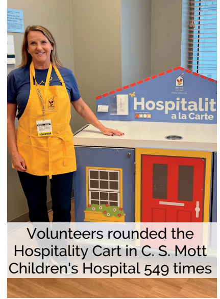
Volunteers rounded the Hospitality Cart in C. S. Mott Children's Hospital 549 times