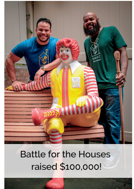
Battle for the Houses raised $100,000!