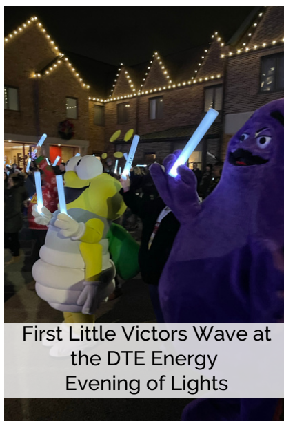
First Little Victors Wave at the DTE Energy Evening of Lights