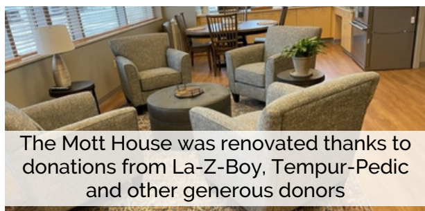
The Mott House was renovated thanks to donations from La-Z-Boy, Tempur-Pedic and other generous donors