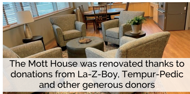
The Mott House was renovated thanks to donations from La-Z-Boy, Tempur-Pedic and other generous donors