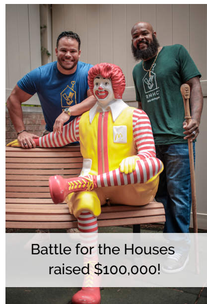
Battle for the Houses raised $100,000!