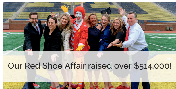
Our Red Shoe Affair raised over $514,000!